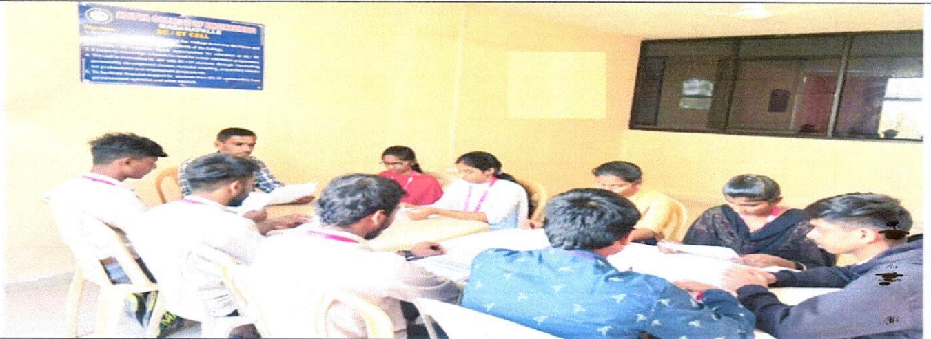
Discussion between SC/ST Cell members