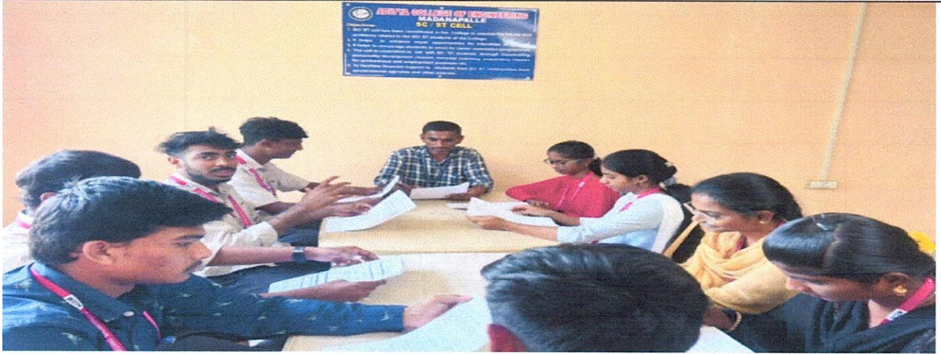
SC/ST Members attended the meeting