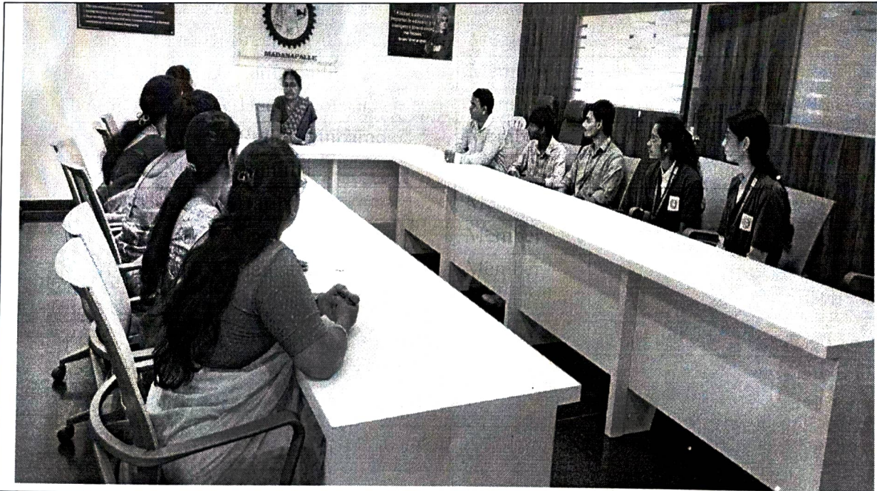
Grievance Redressal Committee members attended the meeting