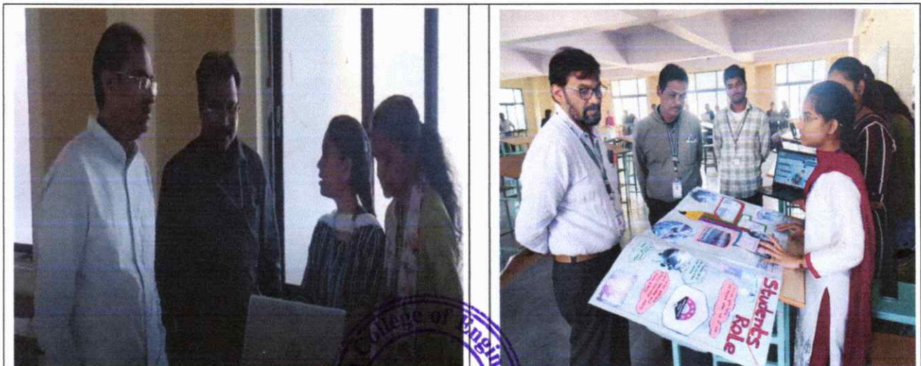
Participants presenting their themes before the Director, Principal, and Judges