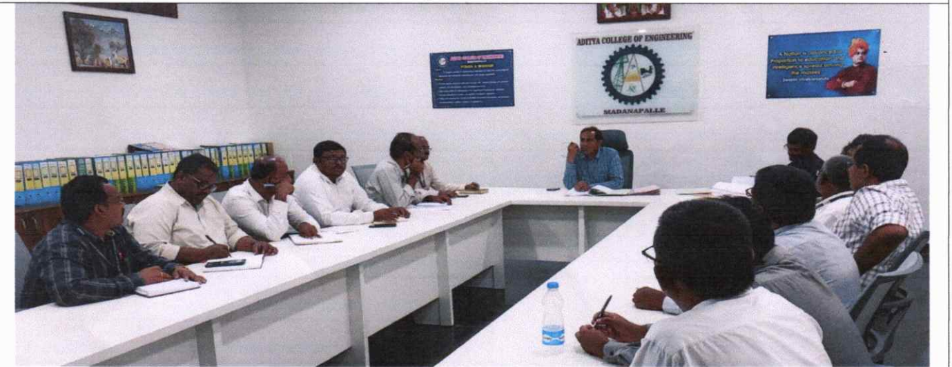
Discussion on the Agenda of the Meeting