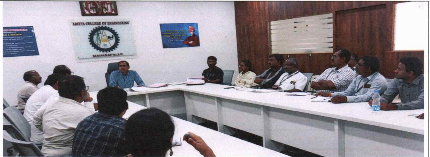
Welcoming the IQAC members