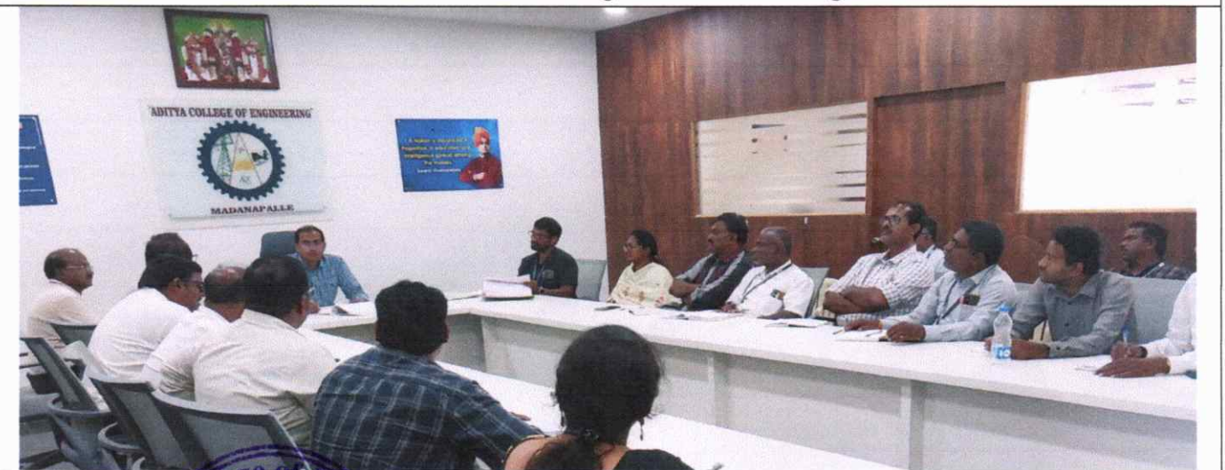
Vote of Thanks by Dean-IQAC