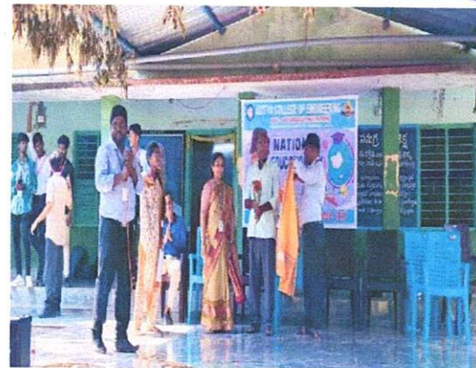
As Part of the Event the Head Master of High School was facilitated.