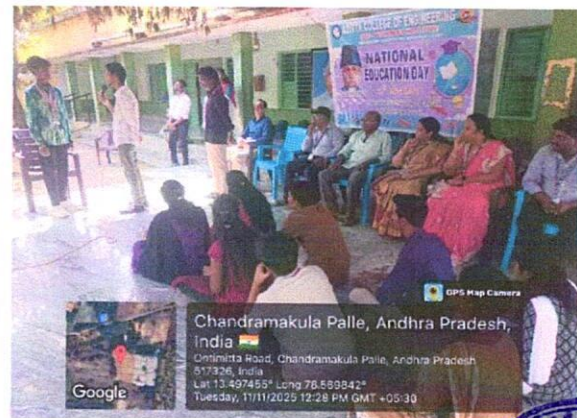
Students perform a skit to educate the students.