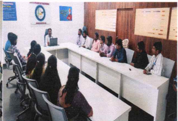
Faculty members attentively listening to the Principal's presentation on academic policies, institutional values, and expectations.