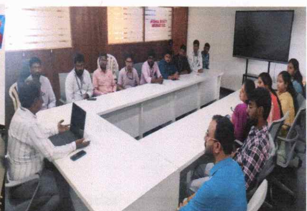
A full view of the induction program showing enthusiastic participation from faculty members across various departments.