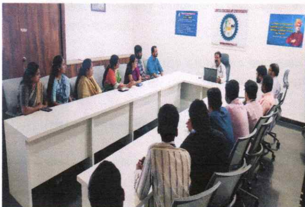
A comprehensive session on administrative facilities, exam section procedures being conducted during the induction program.