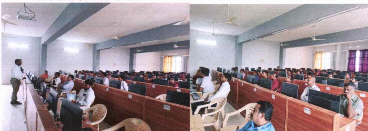
Interactive discussion on implementing innovative teaching practices.