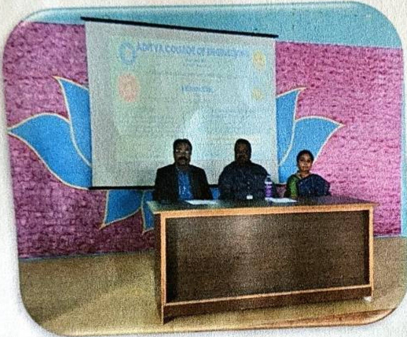
Distinguished dignitaries assembled during Inauguration Session