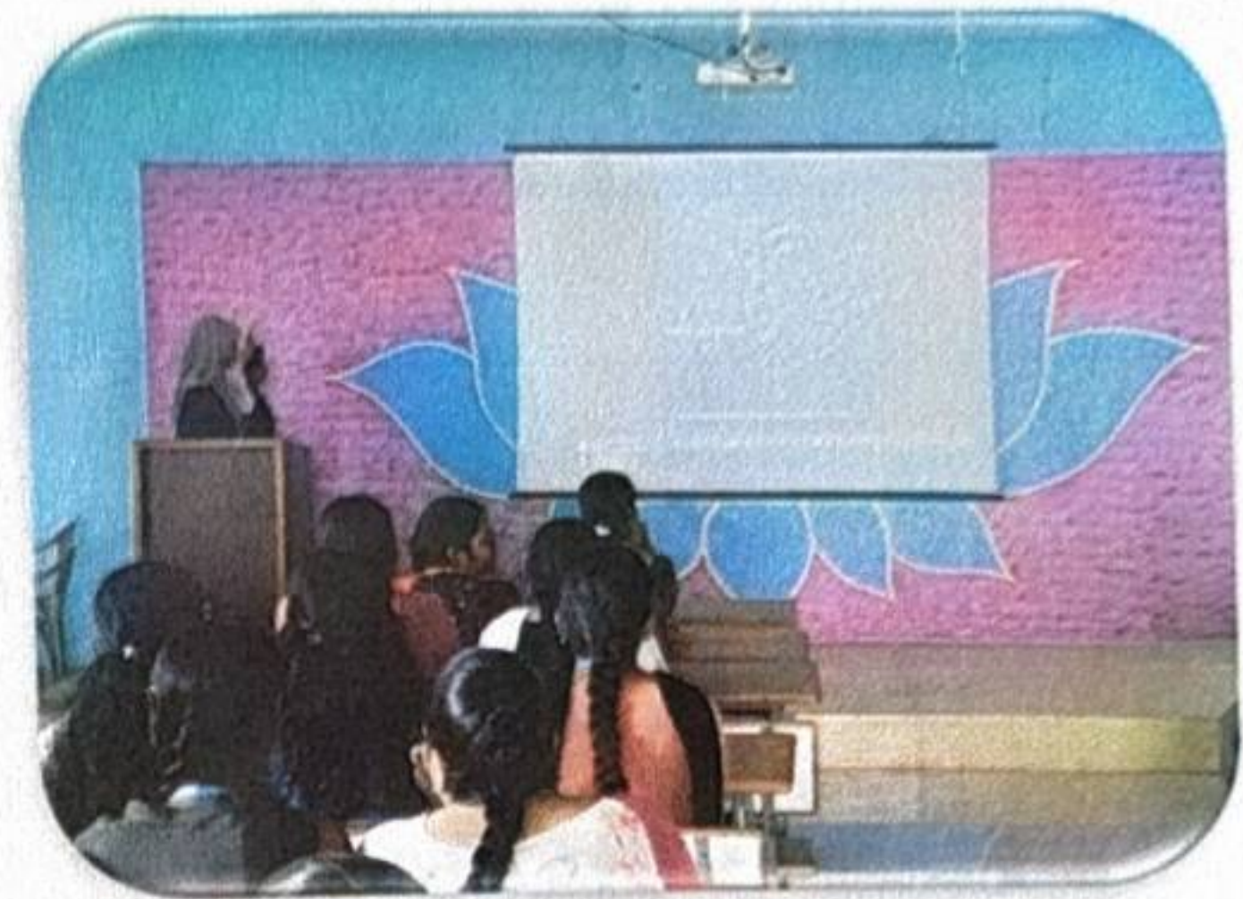
Student teams presenting their innovative idea video on the themes "Simplify Campus Life With AI."