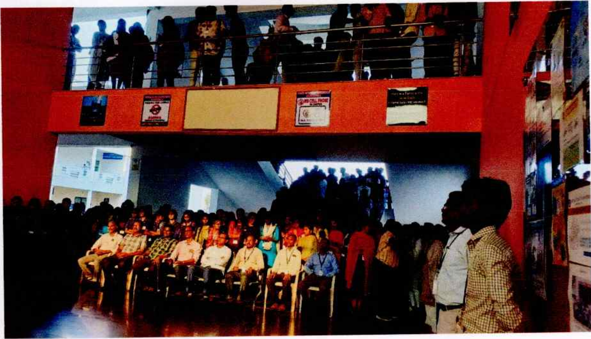
Observation of SKIT by Participants