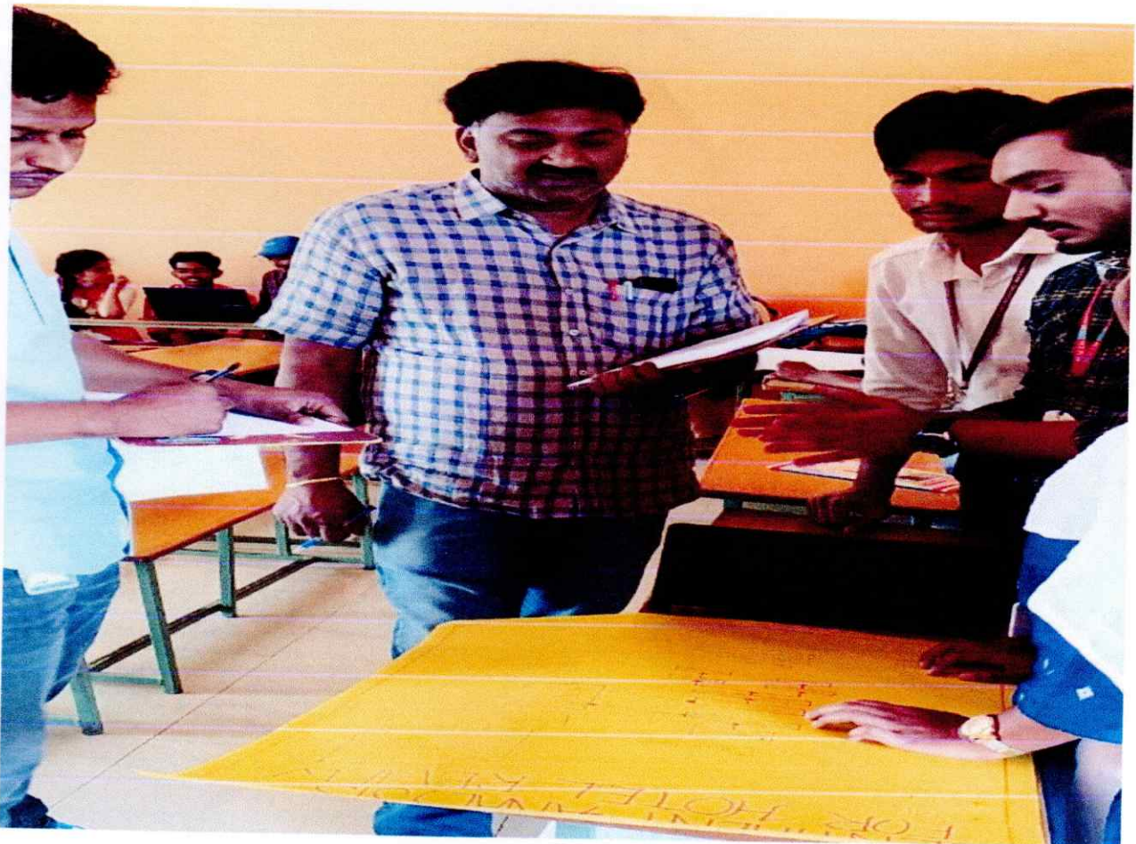
Figure 4: Project Expo experts are evaluating the posters displayed by the participants.