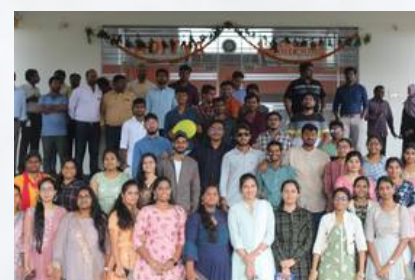
ALUMNI OF ADITYA