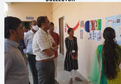
POSTER PRESENTATION-WOMEN'S DAY