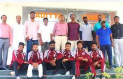
ADITYANS REPRESENT JNTUA

The Annual Cultural Fest 2022 was organized with great pomp and show. There were some mind blowing events like Display and Deliver, Sentence Synergy, Gaming Hackathon, Mock the Press, Crack the Case, Mind Hack, Hit the Target, Face Painting and Tattooing, Selfie Frame Making and Aditya Master Chef.