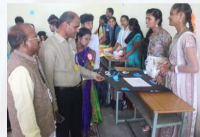
PROJECT EXPO-ANOKHA 2K22