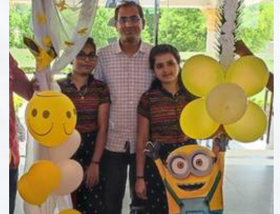
SEFIE FRAME COMPETITION