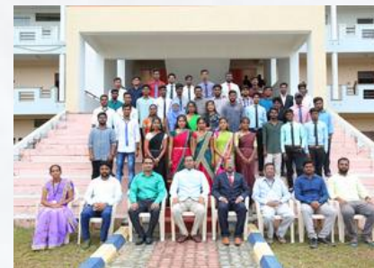
WITH CE STAFF