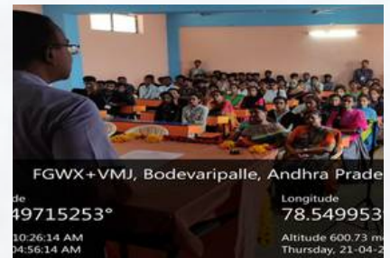
EMBEDDED SYSTEMS -HANDS ON WORKSHOP