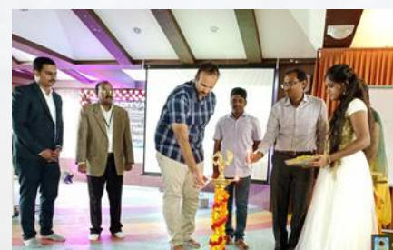
LAMP LIGHTING CEREMONY-AAA