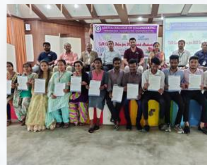
PLACED STUDENTS WITH MNGT