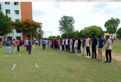
TRACK AND FIELD EVENTS