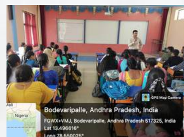
MICROSOFT UPSKILLING PROGRAM