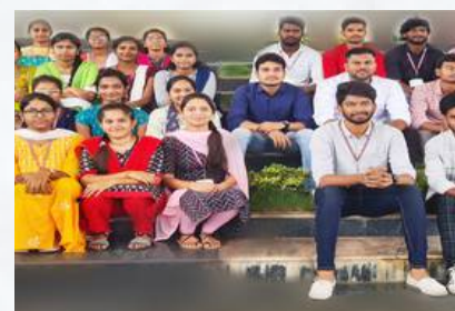
PLACED IN INFOSYS

Placement Index: In the academic year 2021-22, students got 203 offers in various companies.