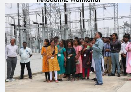
AUTOMATED SUBSTATION VISIT