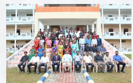
WITH ECE STAFF