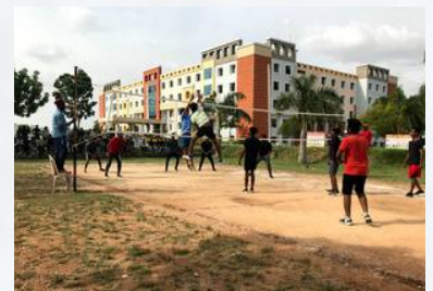
VALLEY BALL MATCH