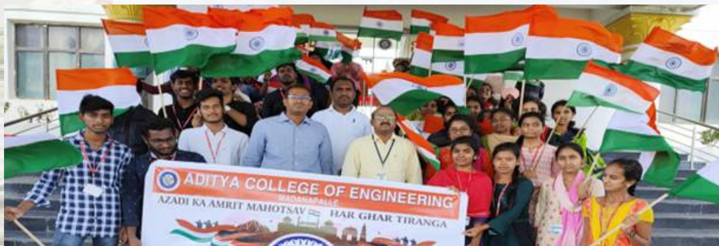
AZADI KA AMRIT MAHOTSAV