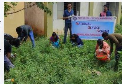
CLEAN AND GREEN