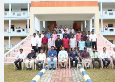
WITH ME STAFF