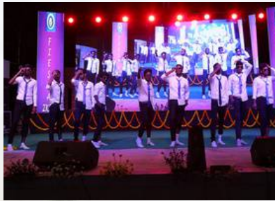
DANCE BY BOYS