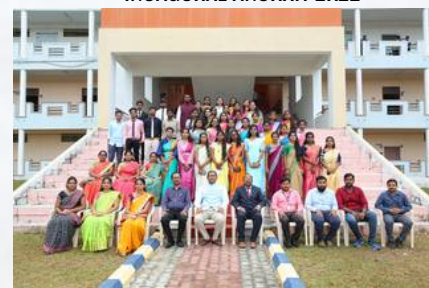
WITH CSE STAFF