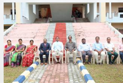
WITH H & S STAFF