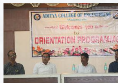
ORIENTATION PROGRAM 2021