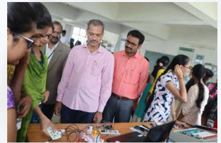
PRAGYOTSAV 2K22-PROJECT EXPO