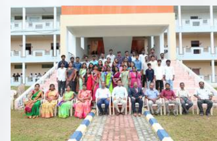
WITH EEE STAF