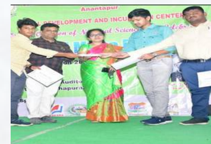
WON FIRST PRIZE