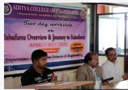
EXPERT TALK- SALES FORCE