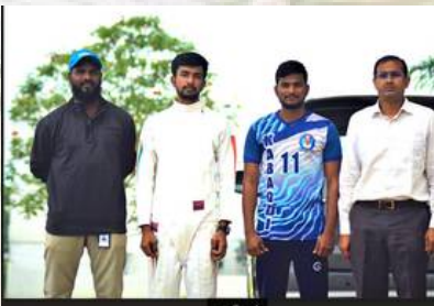
FENCING & KABADDI CHAMPS