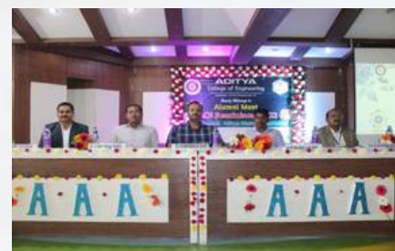
ALUMNI MEET 2022