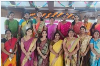
WITH WOMENS STAFF