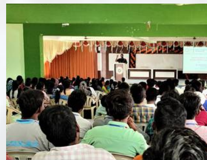
EXPERT TALK-BUSINESS MODEL