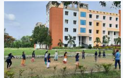
THROW BALL MATCH