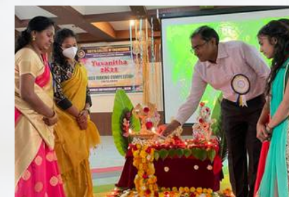
YUVANITHA-2K21 INAUGURAL BY SUB COLLECTOR