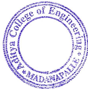
Chairperson Internal Complaints Committee